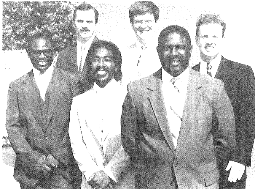
Front Row, left to right: