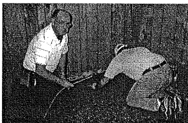
PIN THE WHAT?