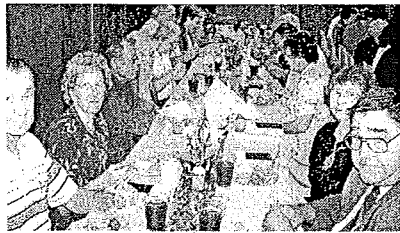
some of our loyal supporters