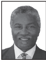
John L. Lewis